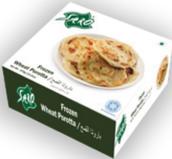
SARO Frozen Wheat Porotta Net Wt: 375 gm (13.2oz)