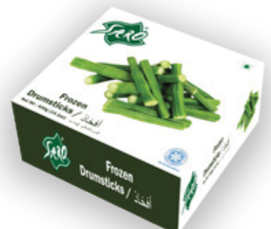
SARO Frozen Drumstick Net Wt: 400 gm (14.1oz)