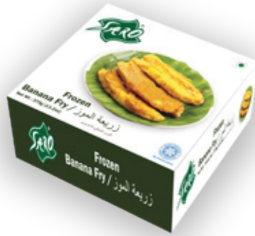
SARO Frozen Banana Fry Net Wt: 375 gm (13.2oz)