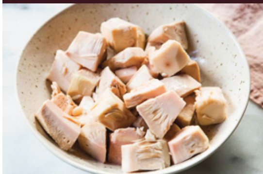
Tender Jack Fruit Chunks

The texture of a tender jack fruit is very meaty, hence its lovingly called " Gaach Pantha " the vegetable meat! or " Idianchakka ". It is a rich source of Vitamins A, C Riboflavin, Niacin etc.