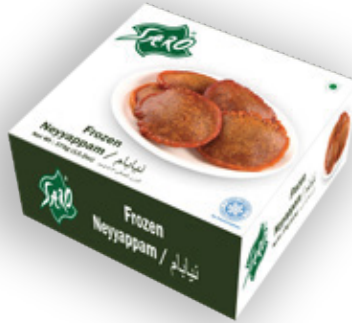
SARO Frozen Neyyappam Net Wt: 375 gm (13.2oz)