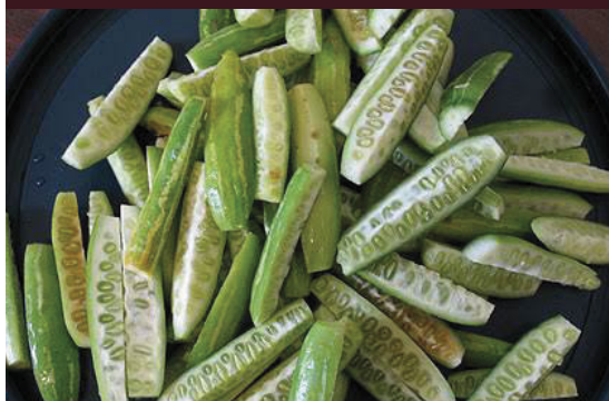
Tindora Long Cut (Kovakka)

It is a perfect side dish for almost any rice and the hot crispy taste makers, it is a snack by itself. This is not only perfect in taste, but is also very healthy dish for diabetes.