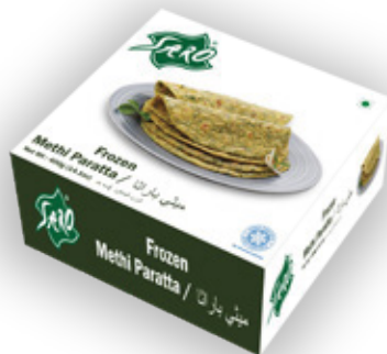
SARO Frozen Methi paratta Net Wt: 400 gm (14.1oz)