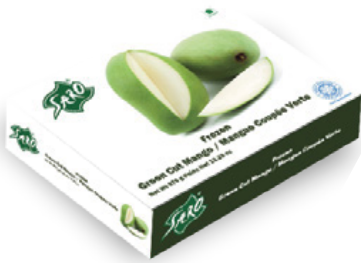
SARO Frozen Green Cut Mango Net Wt: 375 gm (13.2oz)