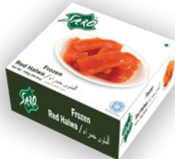
SARO Frozen Red Halwa Net Wt: 750 gm (26.5oz)