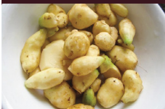
Koorka - Chinese Potato

Koorka otherwise known as Chinese Potato. Delicious but seasonal common small tuber vegetable from South India. Peeled, diced and balanched with turmeric so that ready to garnish as per your taste and desire.