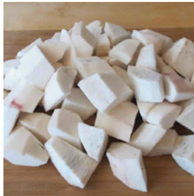
Cassava Half Cut