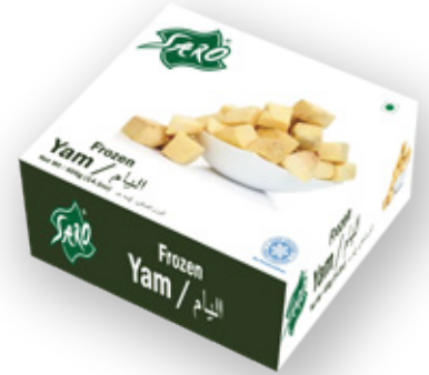
SARO Frozen Yam Net Wt: 400 gm (14.1oz)