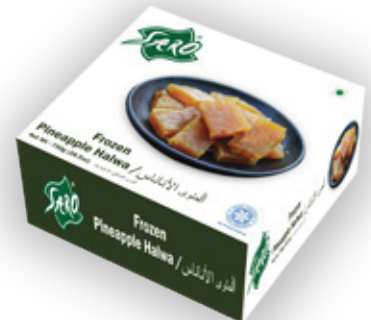
SARO Frozen Pineapple Halwa Net Wt: 750 gm (26.5oz)