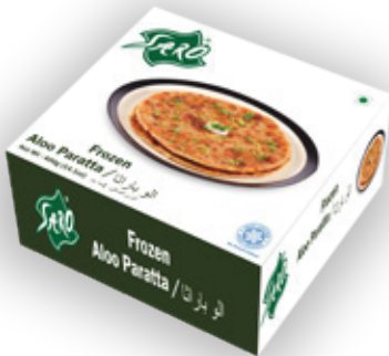
SARO Frozen Aloo Paratta Net Wt: 400 gm (14.1oz)