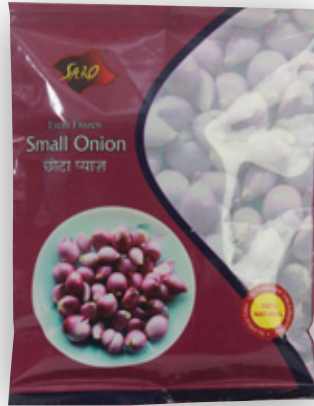
SARO Frozen Small Onion Net Wt: 400 gm (14.1oz)