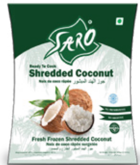
SARO Frozen Shredded Coconut Net Wt: 400 gm (14.1oz)