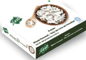
SARO Frozen Sliced Coconut Net Wt: 400 gm (14.1oz)