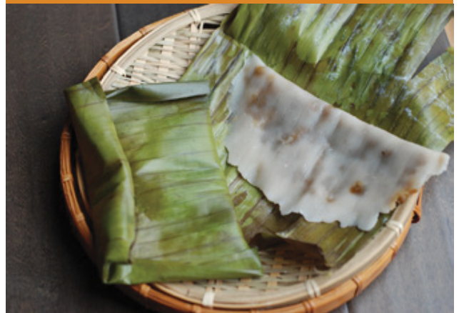
Elayada / Steamed Rice Patties with Coconut & Jaggary

Elayada, a light snack from Kerala, a fine delicacy providing a pleasingly light suggestion of sweet to the consumer. A much adored food item of the region, Elayada is best when taken along with evening tea or coffee.