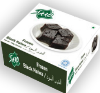
SARO Frozen Black Halwa Net Wt: 750 gm (26.5oz)