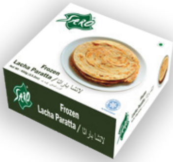
SARO Frozen Lacha Paratta Net Wt: 400 gm (14.1oz)