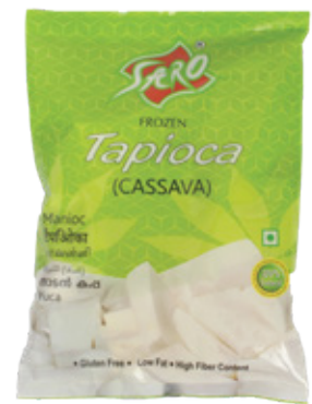
SARO Frozen Tapioca Net Wt: 908 gm (32oz)