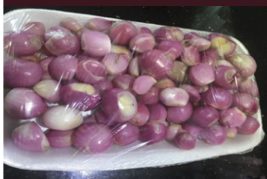
Small Red Onions (Shallot)

Red Shallot Onion - Shallot that is peeled, blanched and ready to use as red small onion is an integral item in most variety of southern ethnic foods. It is also fasmous for the medicinal properties and rich in vitamin source.