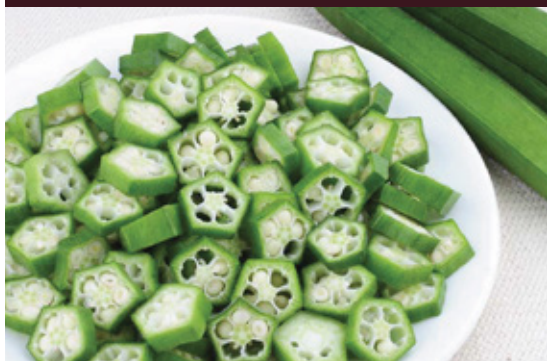
Okra Cut (Lady's Finger)

Frozen Okra or lady's finger is prepared from the clean, sound and adible fresh pods of the okra plant which is properly prepared and processed, and is then frozen and stored at temperature necessary for preservation.