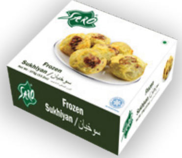
SARO Frozen Sukhiyan Net Wt: 375 gm (13.2oz)