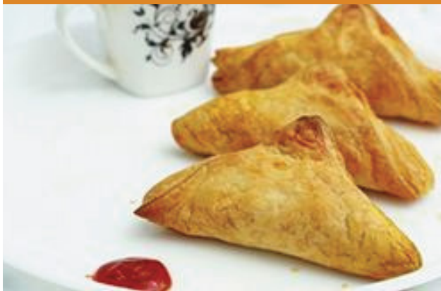
Veg Puffs Triangular