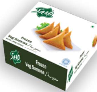
SARO Frozen Veg Samosa Net Wt: 300 gm (10.5oz)