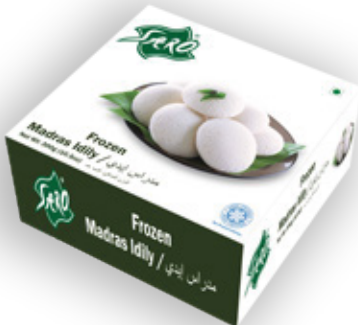
SARO Frozen Madras Idily Net Wt: 300 gm (10.5oz)