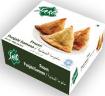
SARO Frozen Punjabi Samosa Net Wt: 480 gm (16.9oz)