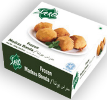
SARO Frozen Madras Bonda Net Wt: 300 gm (10.5oz)