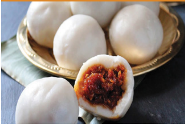
Kozhukattai - Steamed Rice Dumpling