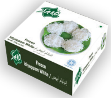
SARO Frozen Idiyappam White Net Wt: 375 gm (13.2oz)