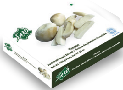
SARO Frozen Jackfruit Seed Sliced Net Wt: 400 gm (14.1oz)