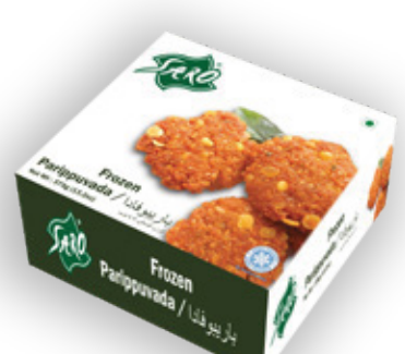
SARO Frozen Parippuvada Net Wt: 375 gm (13.2oz)