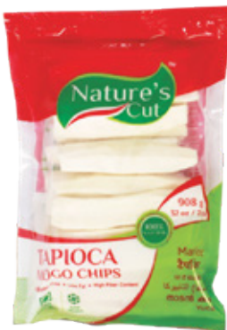
Nature'sCut Frozen Tapioca Mogo Chips Net Wt: 908 gm (32oz)