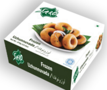
SARO Frozen Uzhunnuvada Net Wt: 375 gm (13.2oz)