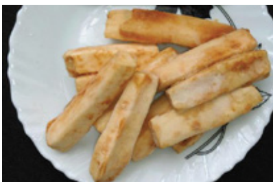
Salt & Chilli