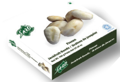
SARO Frozen Jackfruit Seed Net Wt: 400 gm (14.1oz)