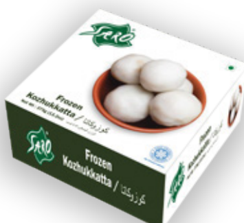
SARO Frozen Kozhukkatta Net Wt: 375 gm (13.2oz)