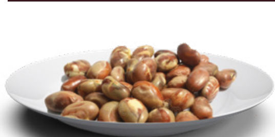
Jack Fruit Seeds

The Jack Fruit's Seeds are edible too, if cooked. It can be deep fried or cooked and is also known for its nutritional values.