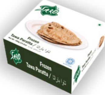
SARO Tawa Paratta Net Wt: 400 gm (14.1oz)