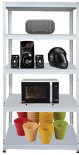
White 5 Shelves