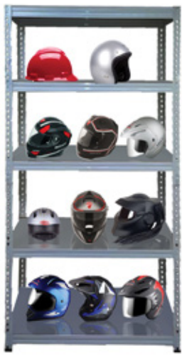
Grey 5 Shelves