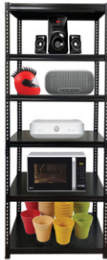
Black 6 Shelves