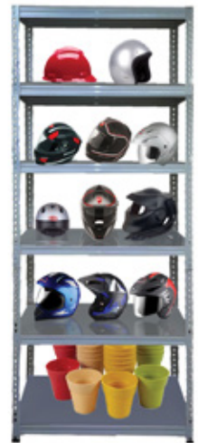
Grey 6 Shelves

Boltless shelving is a flexible shelving alternative by virtue that it may be modified into configurations. It's a type of mix and match storage option.