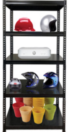
Black 5 Shelves